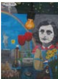
The History 2009