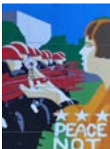
The War 2013