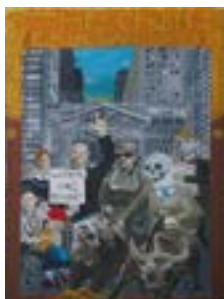
The Crisis 2011