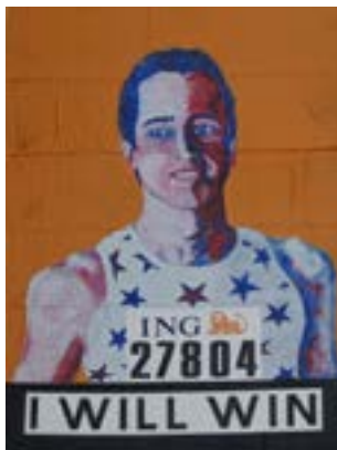
I Will Win 2005