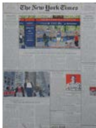
The News 2006