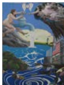
The Creation 2010