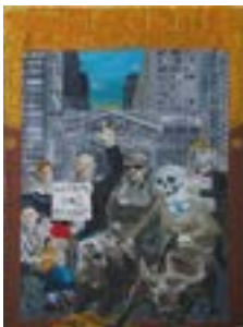
The Crisis 2011