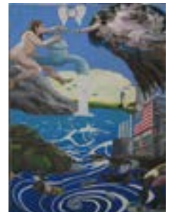
The Creation 2010