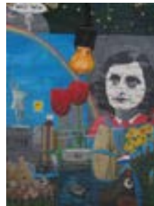
The History 2009