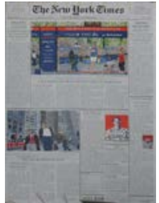
The News 2006