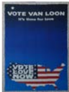
The Elections 2012