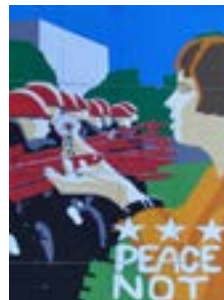
The War 2013