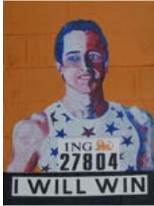
I Will Win 2005