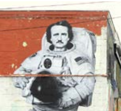
Graffiti Alley, Baltimore