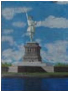
The Statue 2007