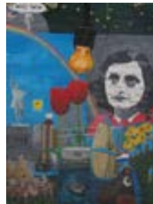
The History 2009