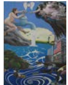
The Creation 2010