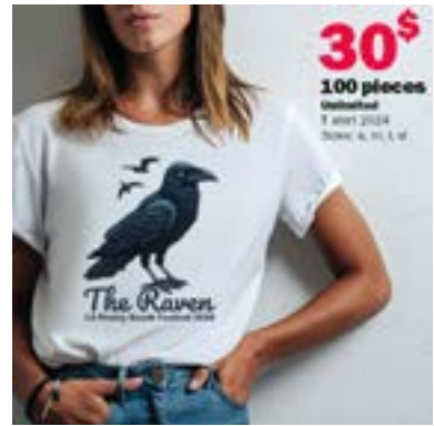
Poetry Downtown Tshirt 2024 100x

Donate $20 and give a Septuagenarian Spew Cocktail to one of the poets at PATCH and we will toast on you!