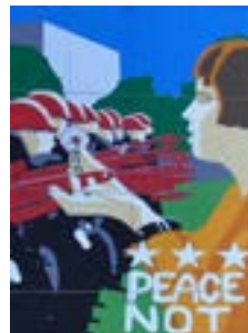
The War 2013