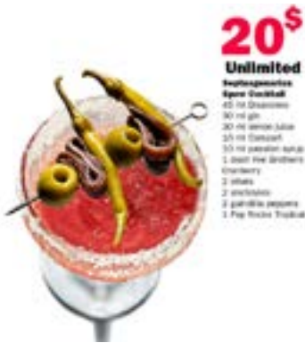
Conductors Club Septuagenarian Spew Unlimited

Donate $20 and give a Septuagenarian Spew Cocktail to one of the poets at PATCH and we will toast on you!