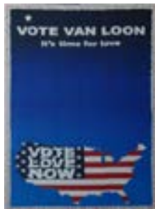
The Elections 2012