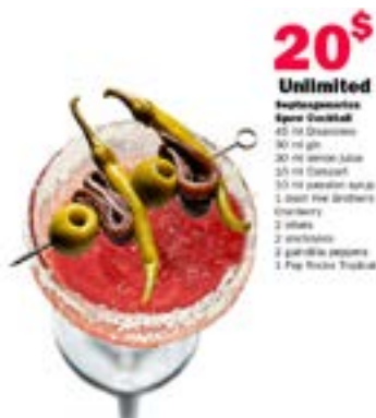
Conductors Club Septuagenarian Spew Unlimited

Donate $20 and give a Septuagenarian Spew Cocktail to one of the poets at PATCH and we will toast on you!