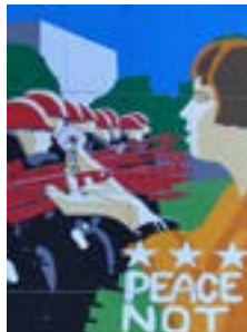
The War 2013