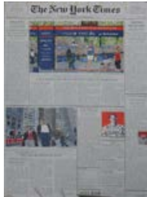
The News 2006