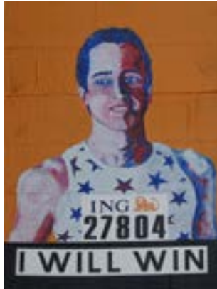
I Will Win 2005