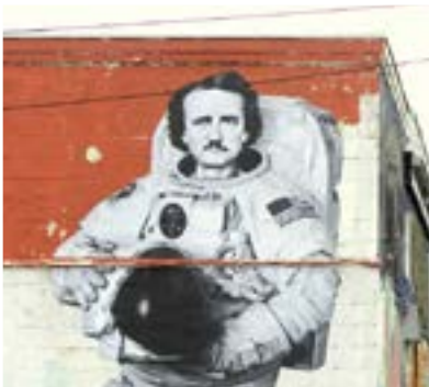
Graffiti Alley, Baltimore