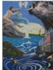
The Creation 2010