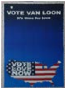
The Elections 2012