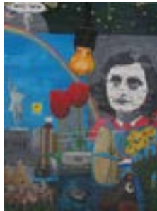
The History 2009