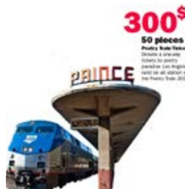
Poetry Train Ticket 2024 50x

Donate $50 and get a 3rd Poetry Downtown shirt (sizes s, m, l and xl) in return!