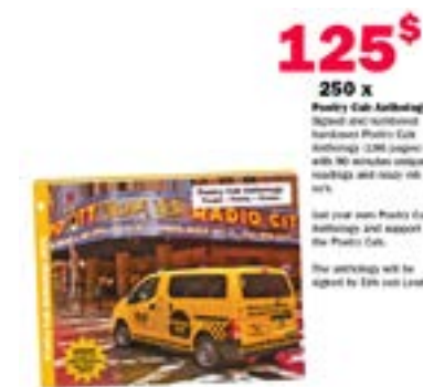
Poetry Cab Art & Poetry Book 250x

Donate $100 and we give your Poetry Train ticket Boston to Baltimore to a poet!