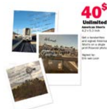
Poetry Train Polaroid On The Tracks Unlimited

Donate $40 and get an On The Tracks Polaroid photo (3.5 x 4.2 inch) with American Short poem in return!