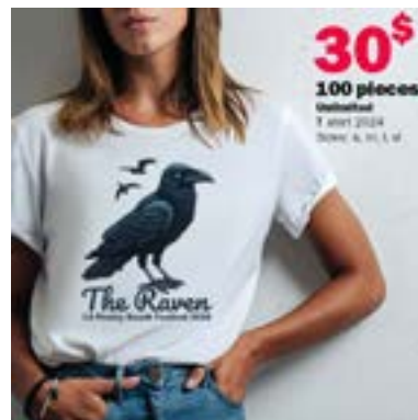
Poetry Downtown Tshirt 2024 100x

Donate $20 and give a Septuagenarian Spew Cocktail to one of the poets at PATCH and we will toast on you!