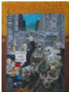
The Crisis 2011